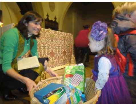
Day School children, their parents and the Women of St. Chrysostom's joined together at the monthly Day School Chapel service in November to bring items for Christmas stockings that will be distributed in December. This outreach ministry is a combined effort of the Day School and WOSC.