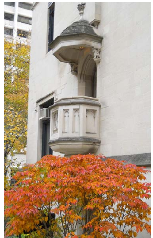
Our courtyard provides an ever-changing palette of seasonal visual treats such as this view of the outdoor pulpit with colorful autumn foliage in the foreground.