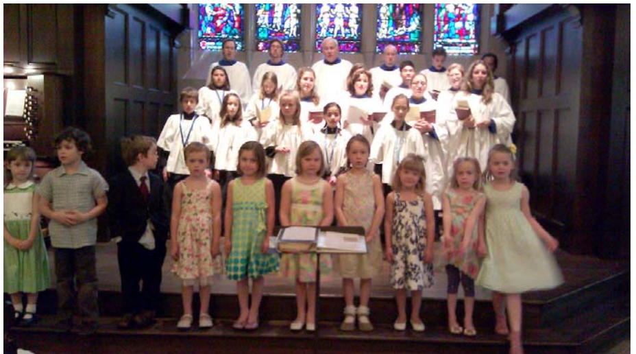
The Choir of St. Chrysostom's, The Advanced Children's Choir, and The Children's Training Choir all participated in providing music leadership on Sunday, May 22, 2011 at the 11 o'clock service.